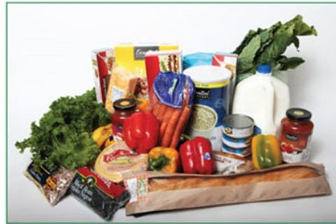
Your food shelf's $10

Food shelves can stretch cash further than donations of food because of their access to discount products and programs. Help us feed more Minnesota families by donating cash to your local food shelf today.